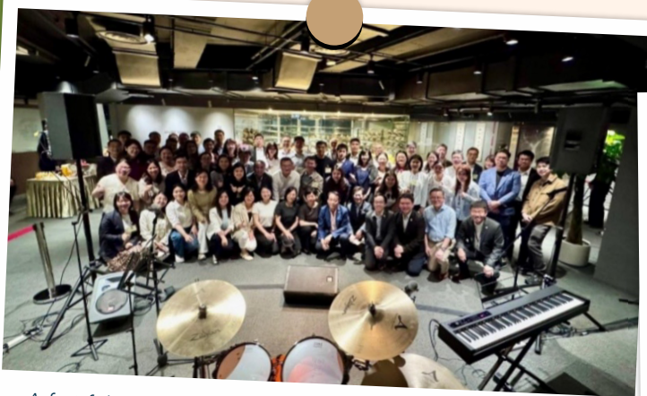
A fruitful evening of exchange with NHC trainees on 16 April