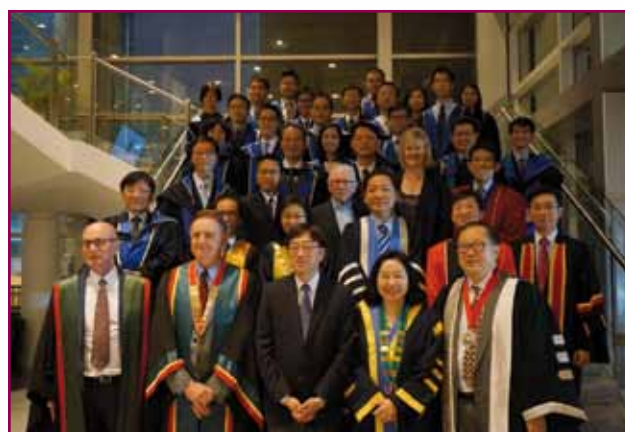
Fellowship/ Membership Conferment Ceremony, The Hong Kong College of Pathologists, 29 November 2014