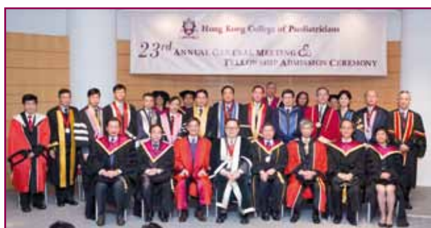
23rd Admission of New Fellows/Members Ceremony of Hong Kong College of Paediatricians, 6 December 2014