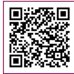
QR code (Android)

To further enhance the online services for CMECPD, the Academy has developed a mobile application for capturing attendance - iCMECPD App. The testing version is now available at Apple's App Store and Google's Play. Fellows may download the App by scanning the respective QR code below (or search "icmecpd" from App Store/Google Play) and install it in their smartphone with operating system in iOS (7.1 or above) or Android (3.0 or above).