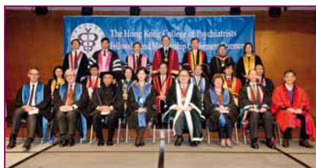
Fellowship/Membership Conferment Ceremony of Hong Kong College of Psychiatrists, 12 December 2014