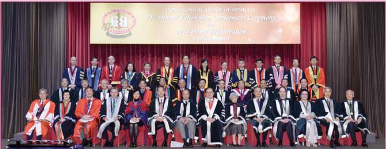
Group photo taken at the Conferment Ceremony