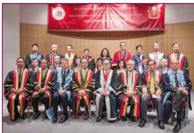
RCSEd/HKCORL Joint Conferment Ceremony, The Hong Kong College of Otorhinolaryngologists, 22 November 2014