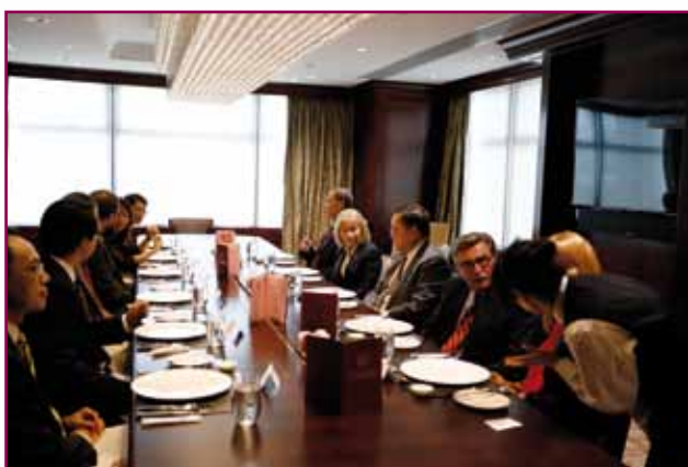
Lunch hosted by the Academy to welcome the delegation