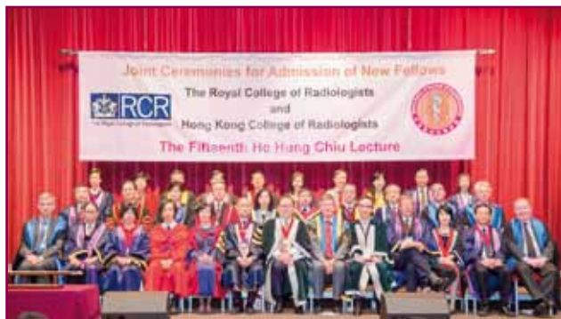
14th Joint Ceremonies for Admission of New Fellows, The Royal College of Radiologists & Hong Kong College of Radiologists, 1 November 2014

President attended several conferment ceremonies held by our specialty Colleges in November and December 2014 to share the happiness with all the new College Fellows on the auspicious occasions.