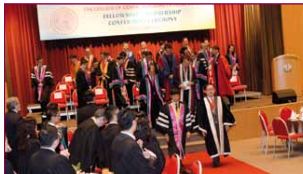
Fellowship/Membership Conferment Ceremony, The College of Dental Surgeons of Hong Kong, 16 November 2014