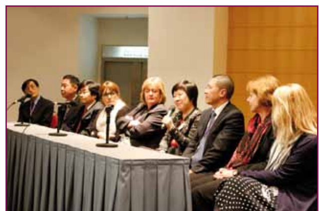
The 1st medical education conference held by the Academy