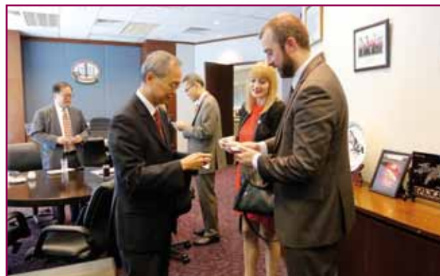
Delegation of University of Glasgow received by Academy’s President and Vice-Presidents at the President’s Suite